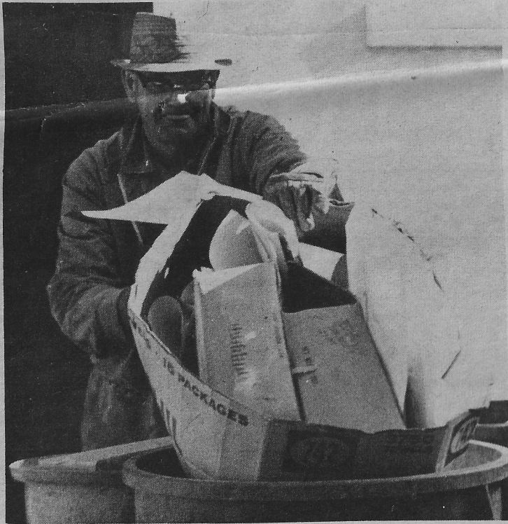
CUSTODIAN BUS PARKS empties one of the many trash cans on campus. Students began a campaign against litter after the Earth Day celebrations held on campus April 22.