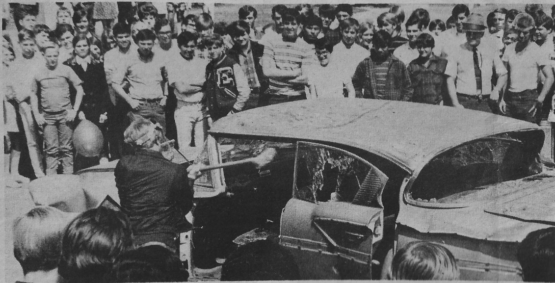
AFTER THE EARTH DAY ASSEMBLY, students participated in the destruction of a major pollution problem, the average automobile.